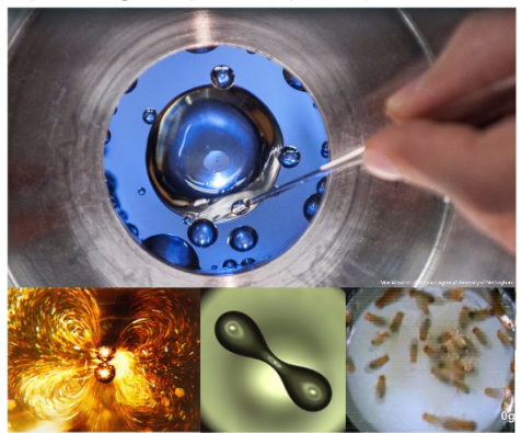
FIG. 1. Top) Droplets of water levitating in a superconducting magnet at the University of Nottingham. Bottom) From left to right: magnetically-levitated bismuth granules shaken in water; a rapidly spinning levitated water droplet undergoing fission; levitated fruit flies.

The equilibrium shape of the drops changes as we spin them up: they deform from spherical to peanut-shaped and eventually break apart. I will discuss recent experiments showing the effect of electric charge on the equilibrium shapes and fission modes of the spinning droplet <sup>[1]</sup> (FIG.2).